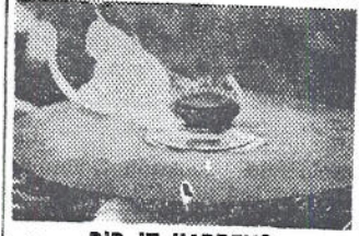
Eternal light burns over JFK's grave