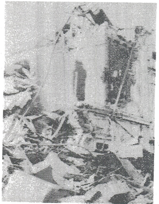
The downtown rail station

'It was the strongest action to get Hanoi to talk'