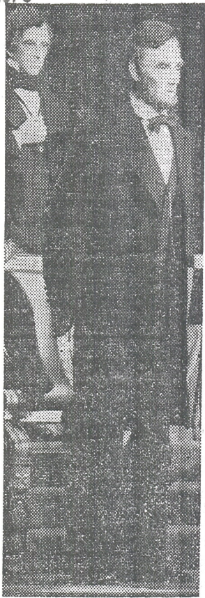
President Lincoln is the only model that speaks. It is programmed for 47 bodily movements and 15 head motions.

While Lincoln speaks, the other Presidents turn his way, blink and nod approvingly. The Lincoln figure is programmed for 47 body movements and 15 head mo-