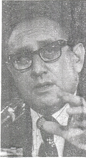
HENRY KISSINGER ... affidavit filed