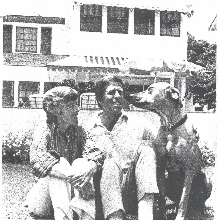
THE HALDEMANs RELAXING AT HOME IN NEWPORT BEACH

For lesser-known members of Nixon's Watergate crew, prison and penury have been the most painful problems. After seven months in prison, former Mitchell Deputy Jeb Stuart Magruder is employed as vice president of a religious foundation in Colorado Springs at half his former $36,000 Government salary. Egil ("Bud") Krogh has been hired as an assistant to Republican Congressman Peter McCloskey of