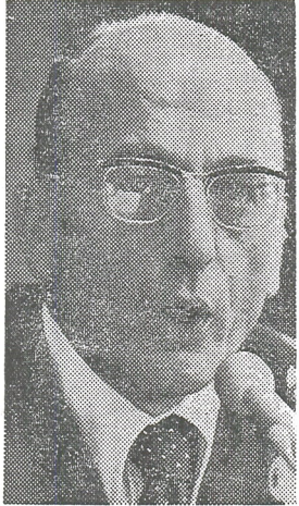
ROBERT C. MARDIAN ... said to offer theories