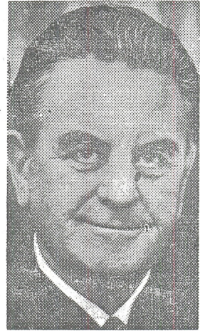
JUDGE JOHN J. SIRICA ... holiday for jurors