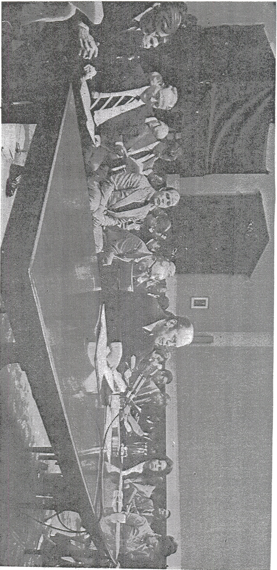
President Ford at the witness table yesterday as he testified before the House Judiciary Committee's Subcommittee on Criminal Justice