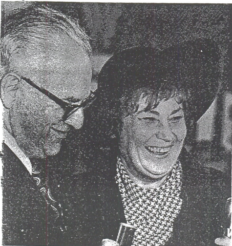
THE HECKLERS THE ABZUGS