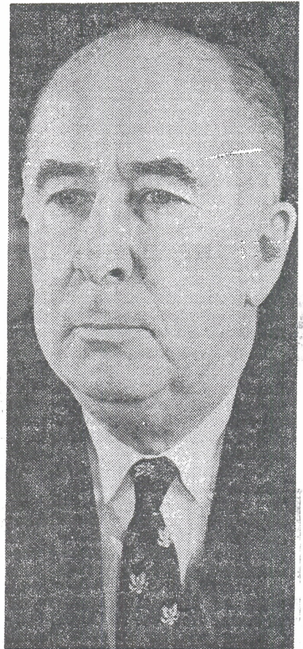
JOHN N. MITCHELL ... seeks to retain privacy