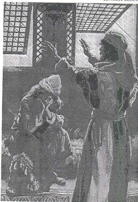
NATHAN REPROACHING KING DAVID

Richard Nixon, on the other hand, has so far scorned even the language of contrition. He referred only to deep "regret and pain" over the Watergate "mistakes" and "misjudgments." His behavior even comes perilously close to that in Jesus' famous parable of the unmerciful servant: a man had been forgiven a large debt by his master, then brutally tried to collect what was owed him by a subordinate. After his own pardon, Nixon fervently opposes amnesty for Viet Nam War resisters. Indeed, according to his son-in-law David Eisenhower, Nixon now says that he would