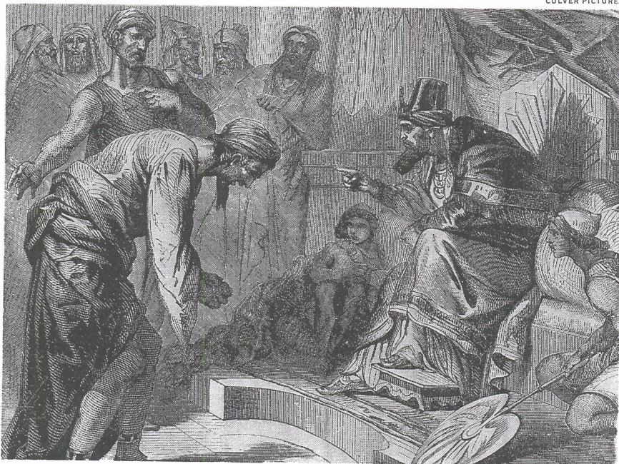
THE ANGRY MASTER REBUKING THE UNMERCIFUL SERVANT