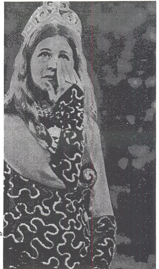
JACKSONVILLE CHEERLEADER IN TEARS