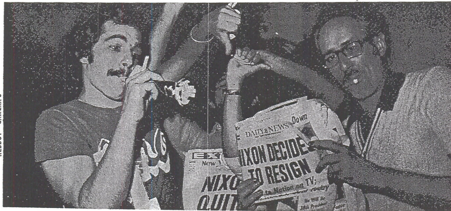
NEW YORKERS CELEBRATING FOLLOWING PRESIDENT NIXON'S TELEVISION ADDRESS