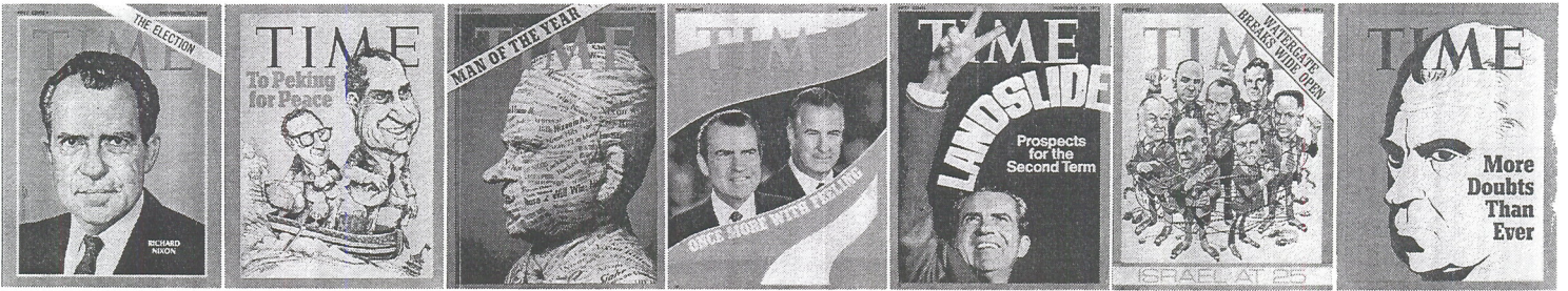
NOV. 15, 1968 JULY 26, 1971 JAN. 3, 1972 AUG. 28, 1972 NOV. 20, 1972 APRIL 30, 1973 MAY 14, 1973