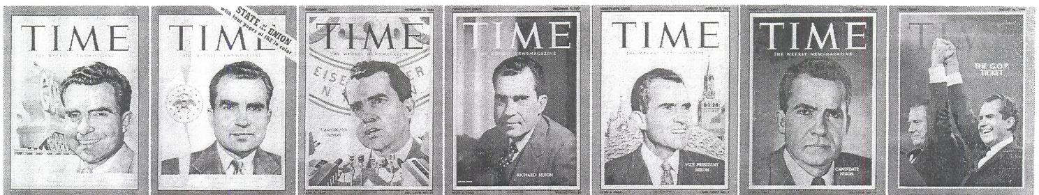
AUG. 25, 1952 JAN. 18, 1954 NOV. 5, 1956 DEC. 9, 1957 AUG. 3, 1959 OCT. 31, 1960 AUG. 16, 1968