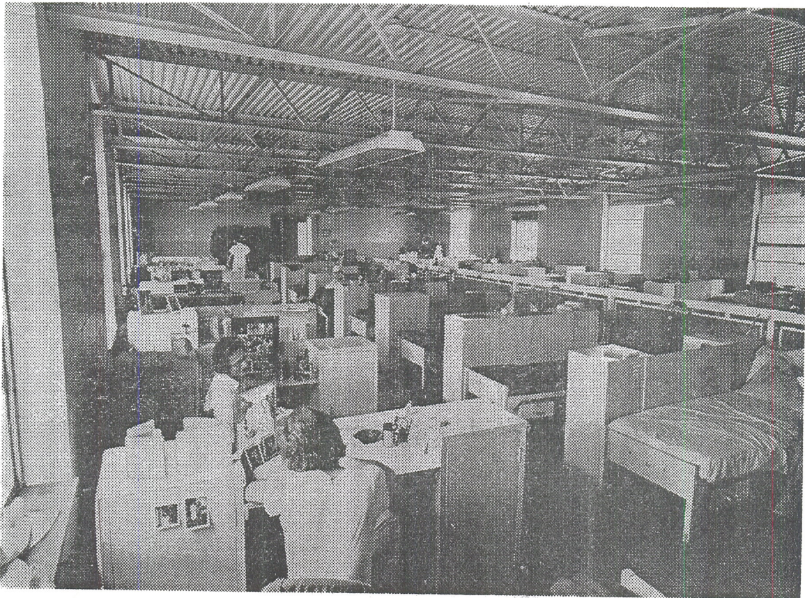
Jeb Stuart Magruder's cot is situated at the fourth window on the left in the background in a dormitory at the minimum security prison

brella tables, a well stocked commissary where each man can spend $40 a month, grassy courtyards, telephones, liberal visiting privileges, and a furlough program.