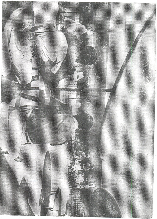
Prisoners can meet their visitors out on the patio at Allenwood federal prison in Pennsylvania