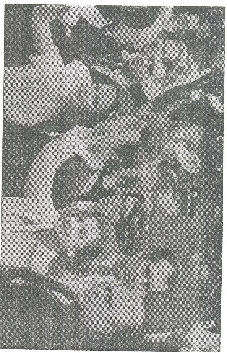
Julie and David Eisenhower and Betty and Gerald Ford waved good-bye to the helicopter