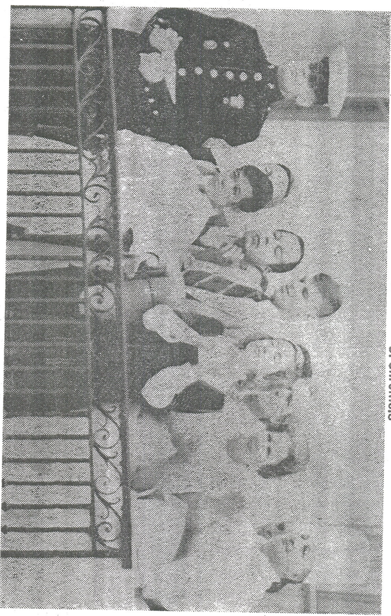
White House staff members applauded Mr. Nixon as he prepared to leave