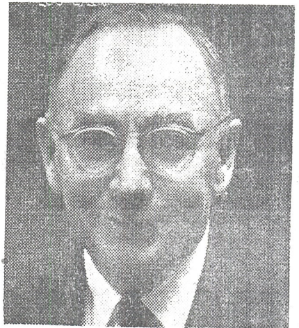
Harold S. Geneen