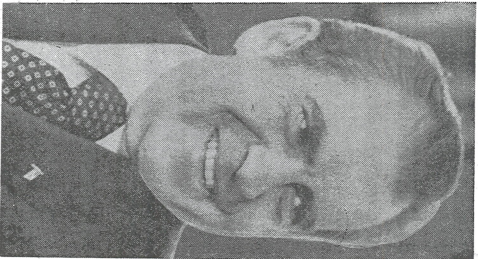
President Nixon presented three faces during a photo session between meetings in the White House and Executive Office Building yesterday.