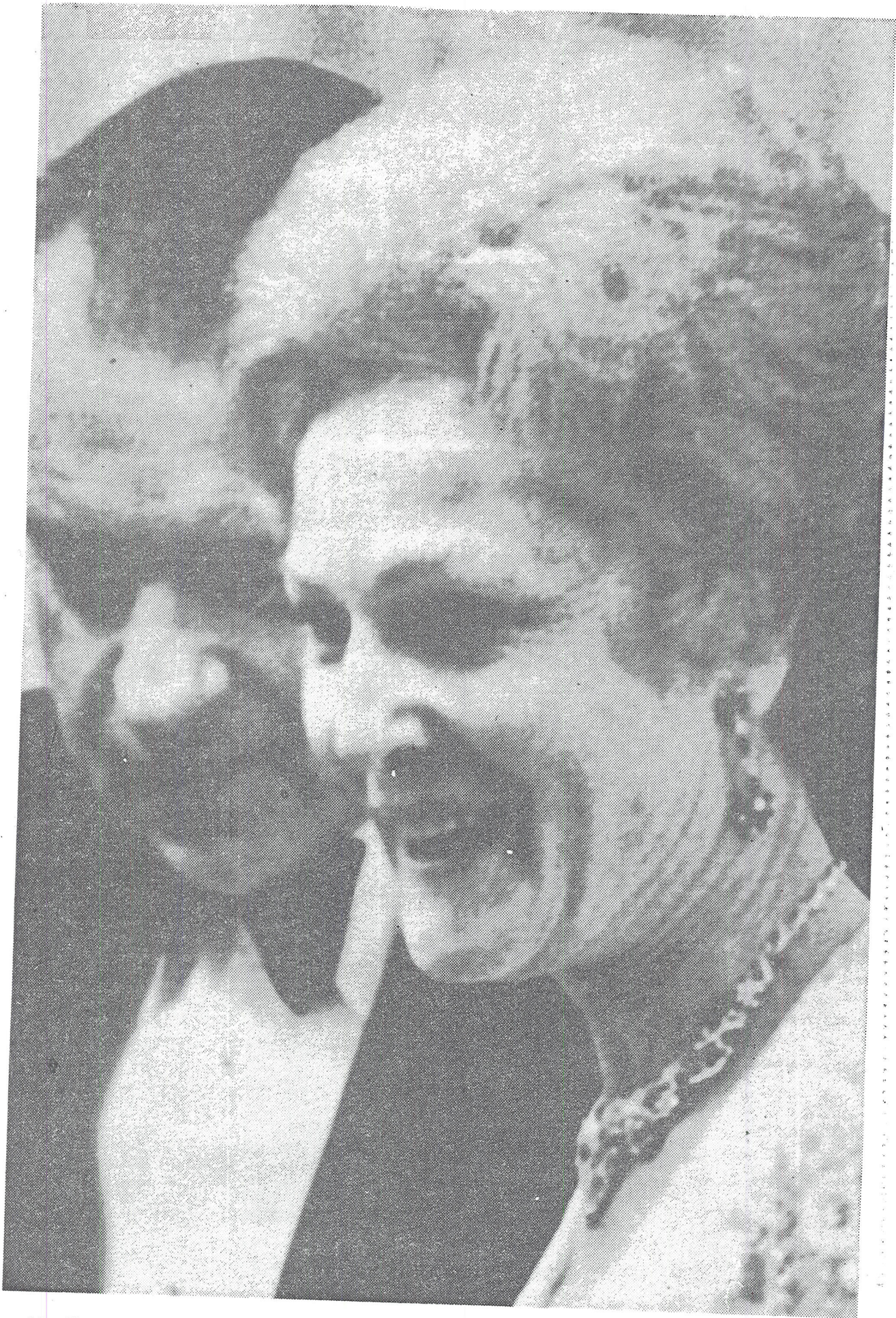
Mrs. Nixon wearing the earrings and necklace from the $52,400 Prince Fahd gift at a White House state dinner for Ivory Coast President Felix Houphouet-Boigny in October, 1973.