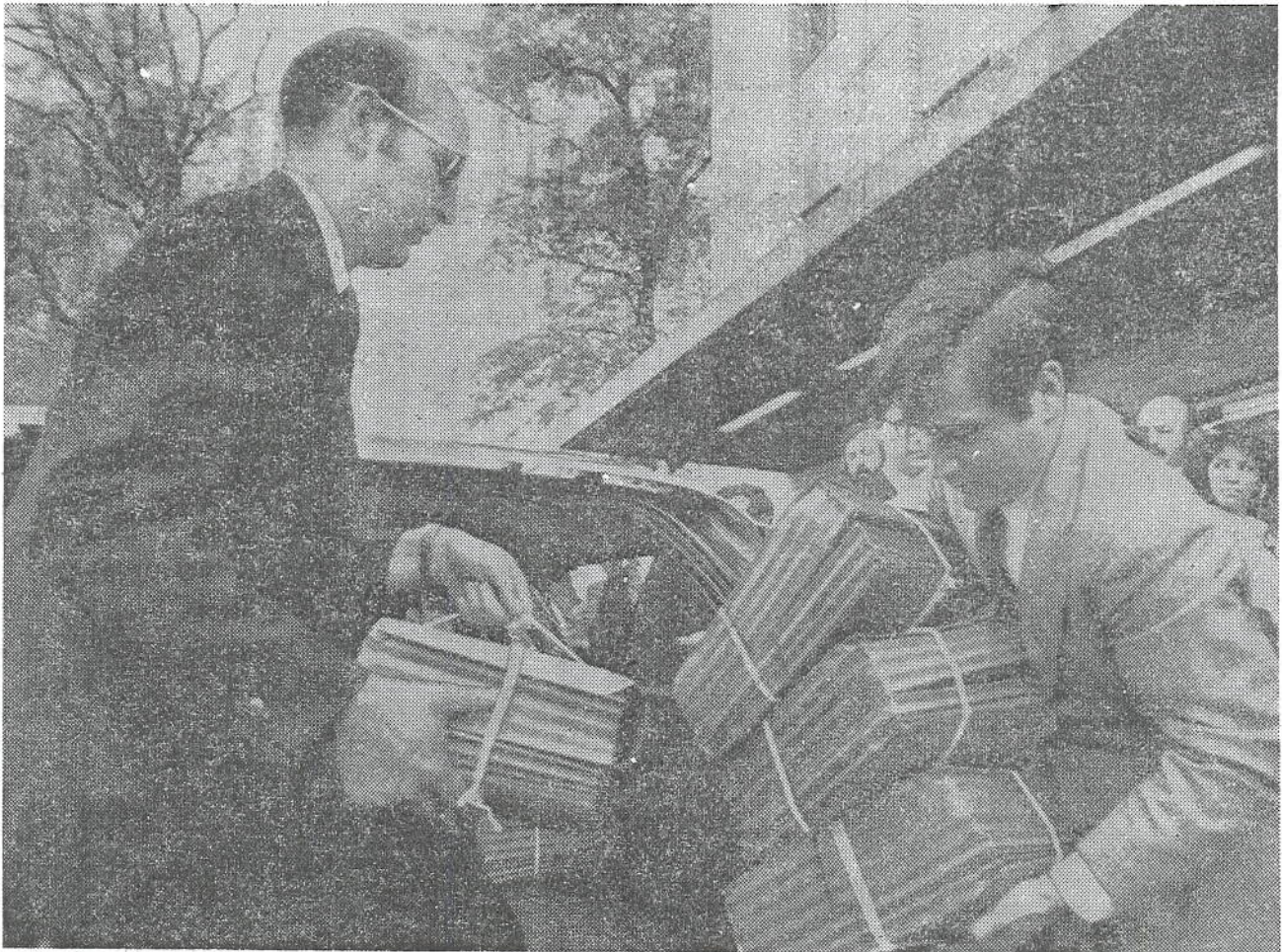
Edited transcripts of many of President Nixon's Watergate-related conversations arrive on Capitol Hill.