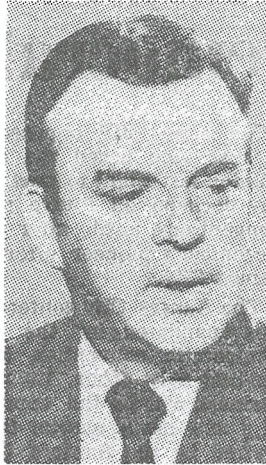
EDWARD V. HANRAHAN ... see voter apathy