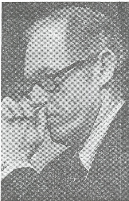
E. HOWARD HUNT JR. ... requested money

talked with an attorney who recommended that he not answer any questions.