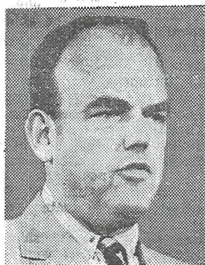
John D. Ehrlichman