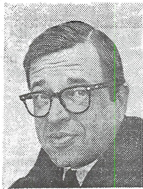
Charles W. Colson