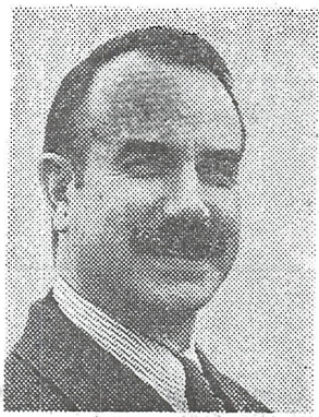
G. Gordon Liddy