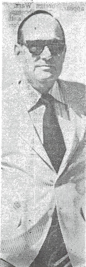
Bernard L. Barker