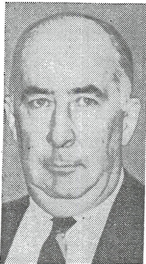
John N. Mitchell Former Attorney General