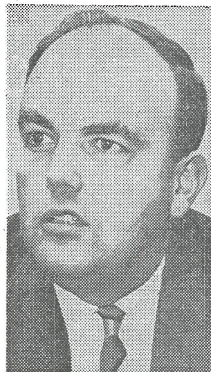
John D. Ehrlichman Was Presidential adviser