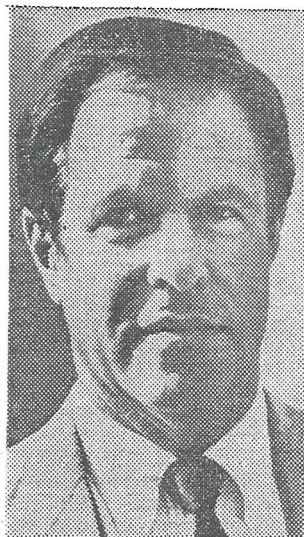
H. R. Haldeman Headed White House staff