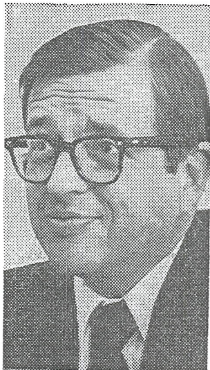
Charles W. Colson Former White House lawyer