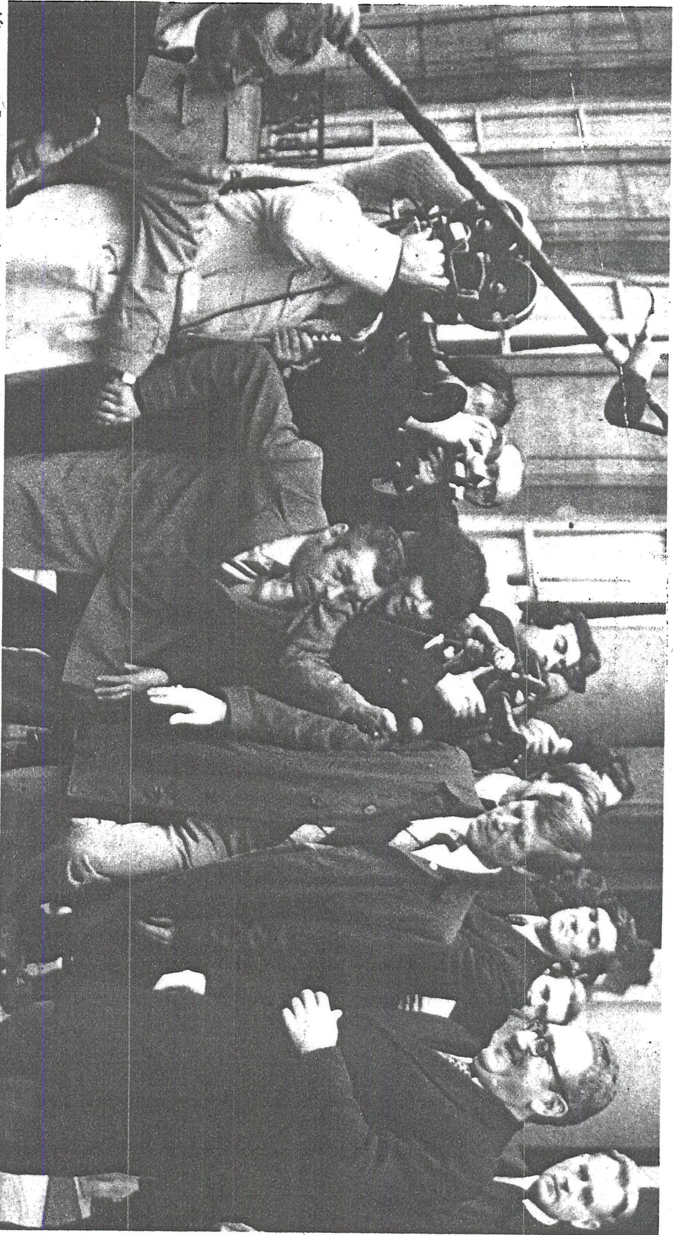
After recent Paris meeting with President Pompidou: Kissinger emerges as security men lock hands. U.S. assigns five Secret Service agents to protect him.