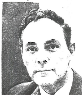
HAIG—THIN ON TOP