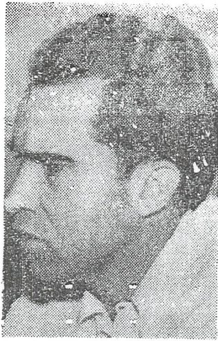
... congressman in '48