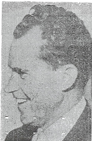
... gubernatorial candidate, '62