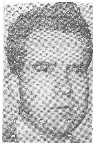
... senator in 1950