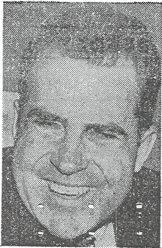
... vice president, 1956