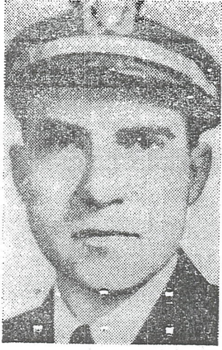
... in Navy in 1940s