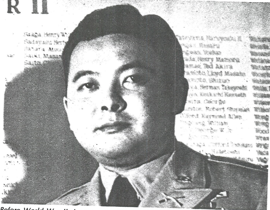
Before World War II, Japanese-Americans in Hawaii had no political power, but after the war, veterans like Captain Inouye reached for political and social equality and achieved it. Today, they control the state legislature, and Hawaii's two U.S. Senators are Hiram Fong (Chinese-American) and Daniel Inouye (Japanese-American).