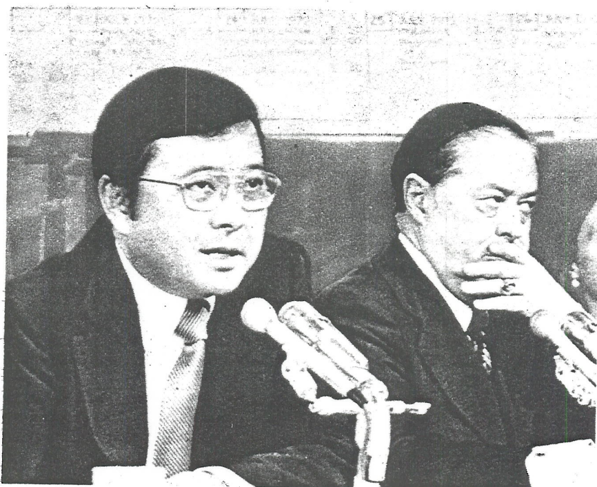
Of the seven on the Watergate committee, Dan Inouye (l.), shown with Sen. Joseph Montoya (D,N. Mex.), seemed to the public to be most fair questioning witnesses. Inouye is well liked by Senate colleagues, who call him "Danny."