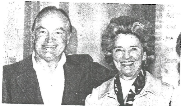
BOB HOPE AND WIFE DOLORES

A. Republican Bob Hope, richest actor in show business—estimated wealth $300 million—contributed $50,000 to the Nixon campaign in 1972. Others in show business, not actors, contributed more. For example, Jack Warner, last of the Warner Bros., contributed $100,000 to Nixon. Ted Ashley, chairman of Warner Bros., contributed $137,056. Jules Stein, the eye-physician-turned-band-booker who founded MCA, contributed $117,822. Taft Schreiber, also of MCA, and once Ronald Reagan's agent, contributed $66,102. Jack Wrather, owner of the Lassie TV series, contributed $84,059. Producer Hal Wallis contributed $7500.