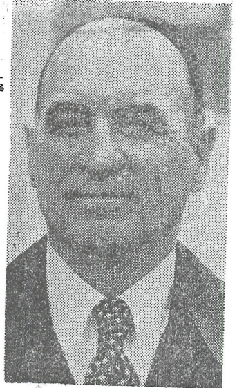
JAMES W. McCORD

about Watergate has come out, and added he participated in the breaking "because