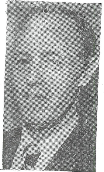
E. HOWARD HUNT