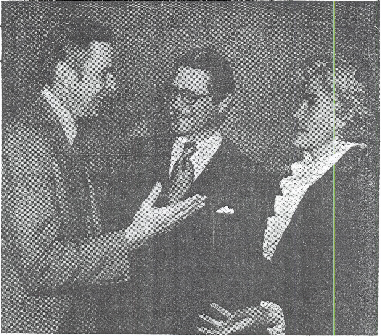
RESIGNATION of Elliott Richardson, center, stirred up a presidential boomlet. Here he's with his wife and Sen. Dewey Bartlett (R-Okla.).

The wife of the Vice Presidential nominee says over 80 FBI agents are going through her husband's background with a fine tooth comb but she isn't worried. "There's absolutely nothing wrong with Jerry's health," said Betty, smiling at the thought of her robustly healthy husband. Among the facts the agents are covering is every doctor Jerry Ford has seen in the past 20 years. She laughed when her husband said he supposed he would have to list the doctor who did nothing more than put a pad around a heel blister he got when skiing at their place in Vail, Colo.