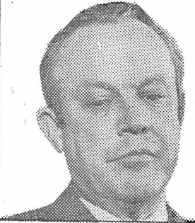
Richard G. Kleindienst Mar., 1972—May, 1973