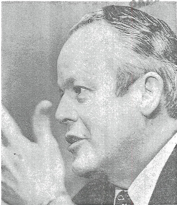
United Press International