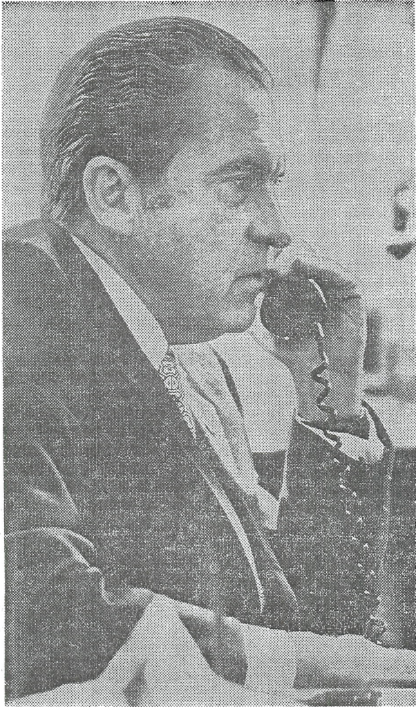
No privacy with a telephone around

fornia politics, to the cost factors in political publicity, to the sequence of railway towns in Ohio — just which towns lay north or south of Lima, Ohio, for example, and what people made there. The mind embraced the ethnic pattern of America, personalities at the Pentagon, draft figures and the impact on colleges.