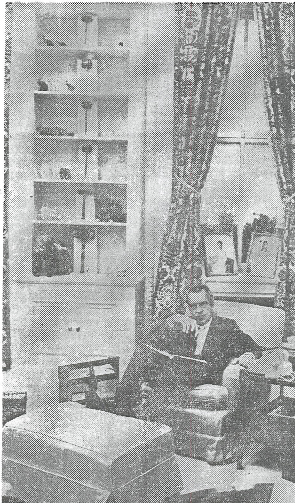
A study in the Executive Office Building

He had problems with the military, of course. But if the allies came into the space adventure, per-