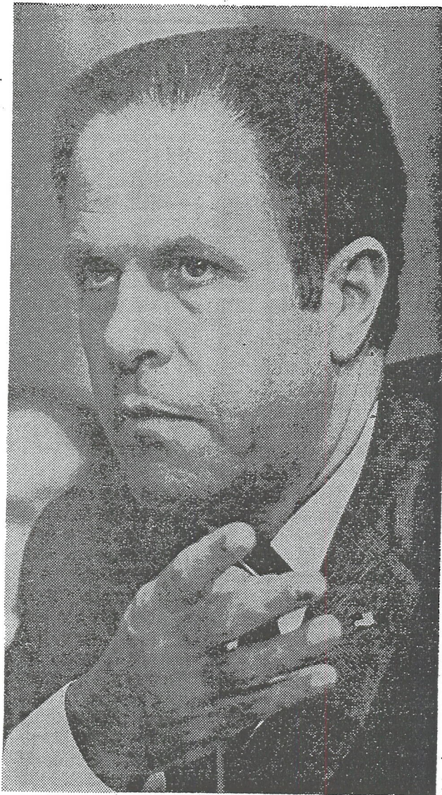
Haldeman answers question put to him by committee.

His manner in recounting his role was, likewise, modest. Despite his reputation as a precision-drill staff director, he easily conceded the fallibility of his own memory, often yielding on small particulars to the superior recollections of men who were once subordinates.