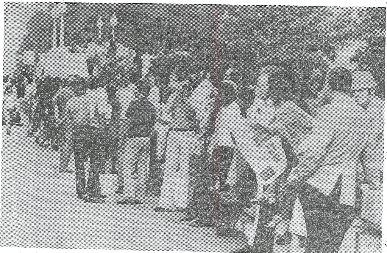
People lined up yesterday outside the Old Senate Office Building, awaiting admission to Watergate hearing

Q. And I take it you were aware of all of the facets of the Huston plan, what the recommendations were that were being made and as it finally went up to the President.