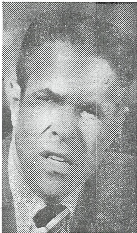
H. R. (BOB) HALDEMAN ... picture of an anomaly

But will they come to distinguish between the Haldeman prior to the White House days (B.P.—before power) and the Haldeman of the Washington era? There