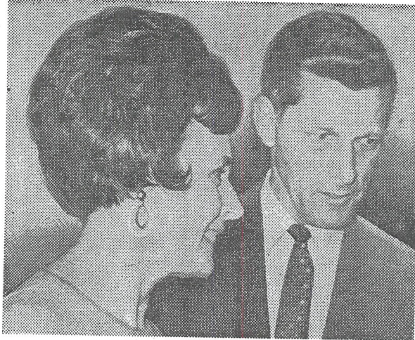
Sen. and Mrs. Gale McGee