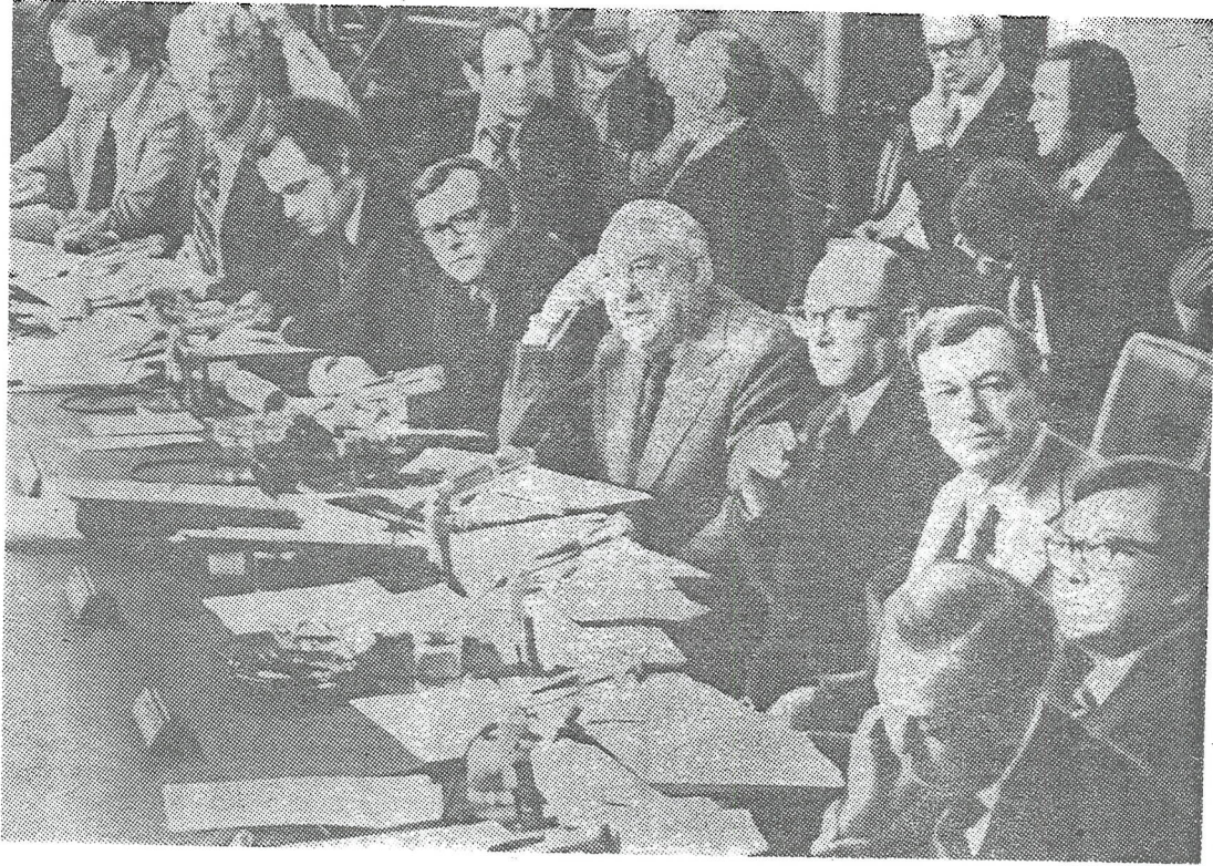
THE SENATE SELECT COMMITTEE FACES THE CAMERA