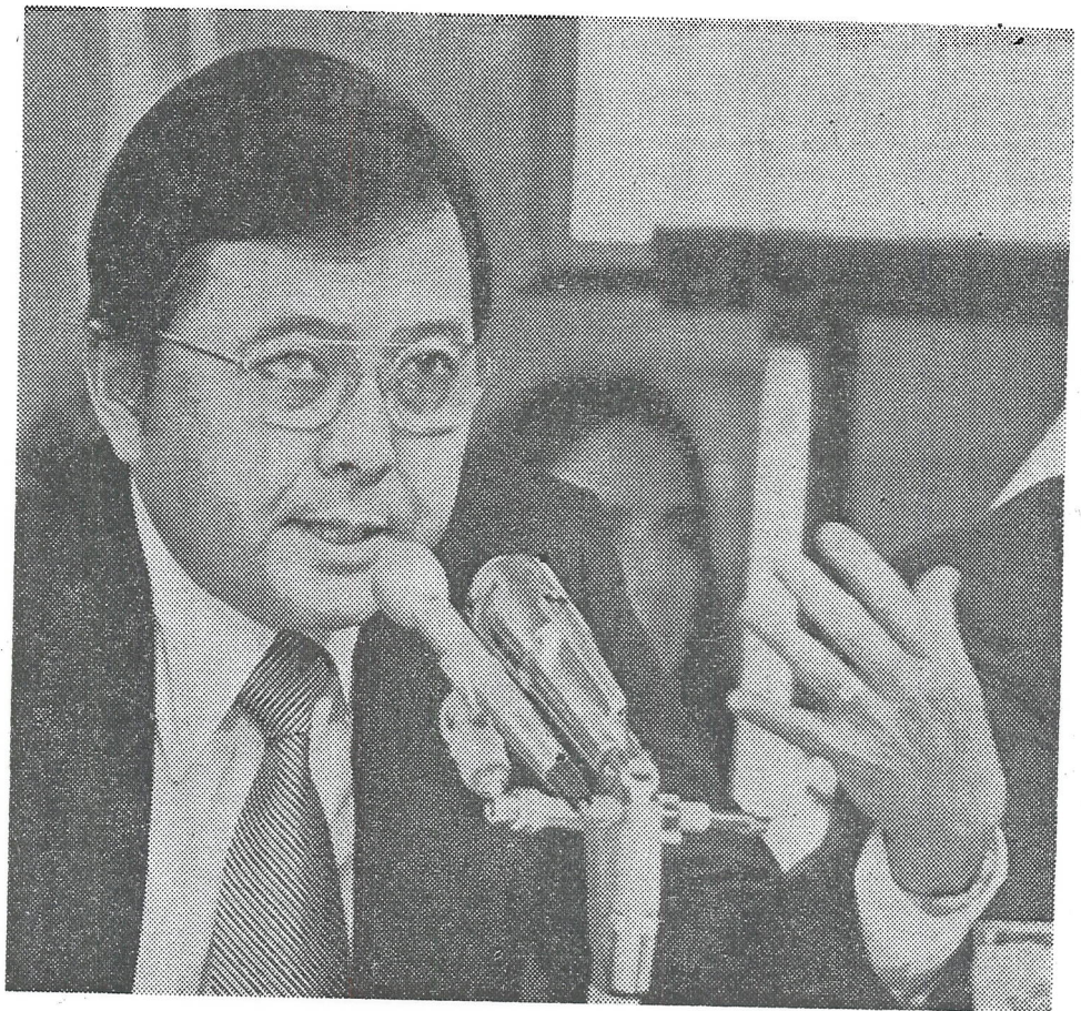
Daniel K. Inouye, Democrat of Hawaii, questioning John D. Ehrlichman yesterday

A. Now, it seems to me that it would have been folly for me at some later time, then, to suggest that the briefcase be thrown into the flood tide of the Potomac.