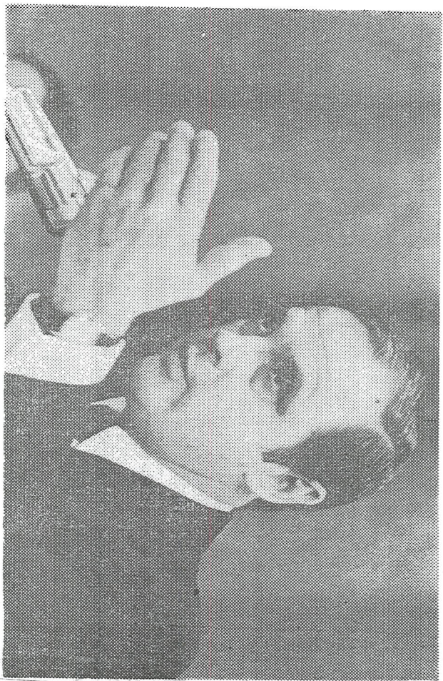
Alexander P. Butterfield, former White House aide, told of taping conversations