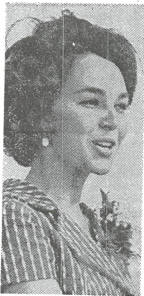
JULIE EISENHOWER Particularly concerned

yesterday (Monday), and she seemed to be in good spirits," the friend said.