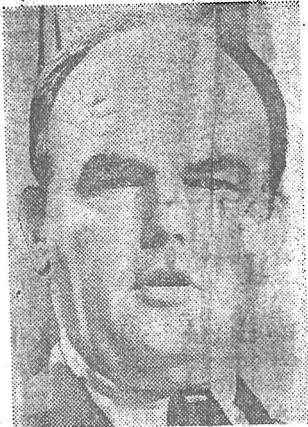
JOHN D. EHRlichMAn