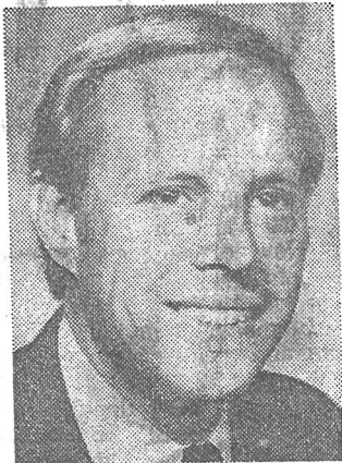
JOHN W. DEAN III