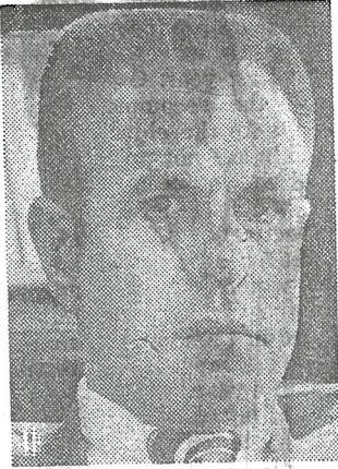
H. R. HALDEMAN