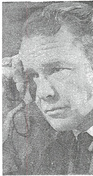
ROBERT H. FINCH ... said to decline offer

The President is continuing his investigation and consulting daily with Assistant Attorney General Henry E. Petersen, Ziegler said,