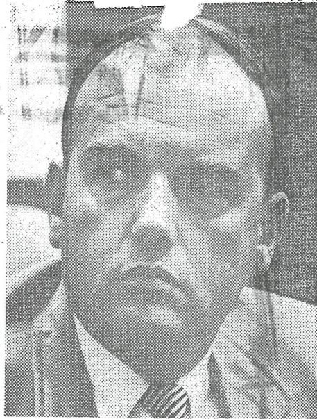
John D. Ehrlichman