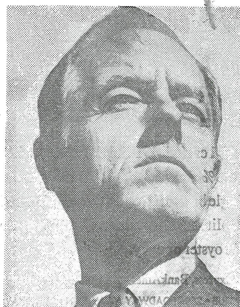
E. Howard Hunt Jr.

icized for making available to Mr. Dean more than 80 of his agency's raw reports on the investigation.