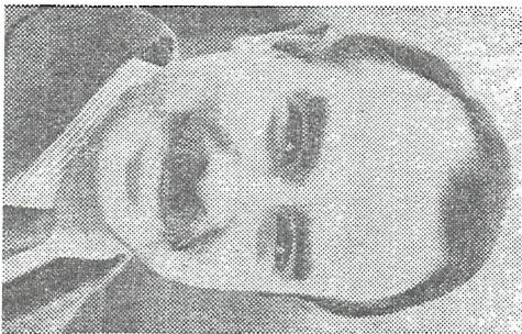
G. Gordon Liddy