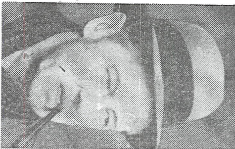
E. Howard Hunt