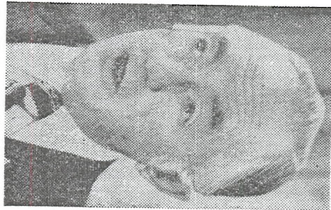
Maurice H. Stans