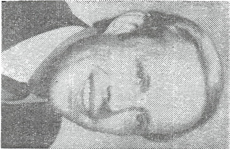
John W. Dean III