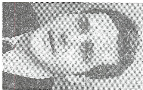
Jeb S. Magruder