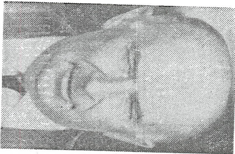
John N. Mitchell