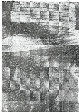
E. HOWARD HUNT JR. ... airs complaint