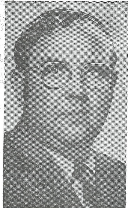
The Washington Post