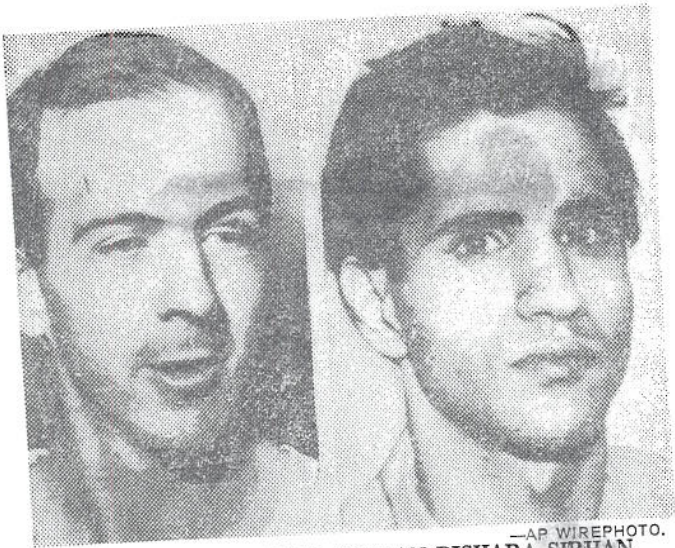
LEE HARVEY OSWALD, SIRHAN BISHARA SIRHAN The dead and the jailed.