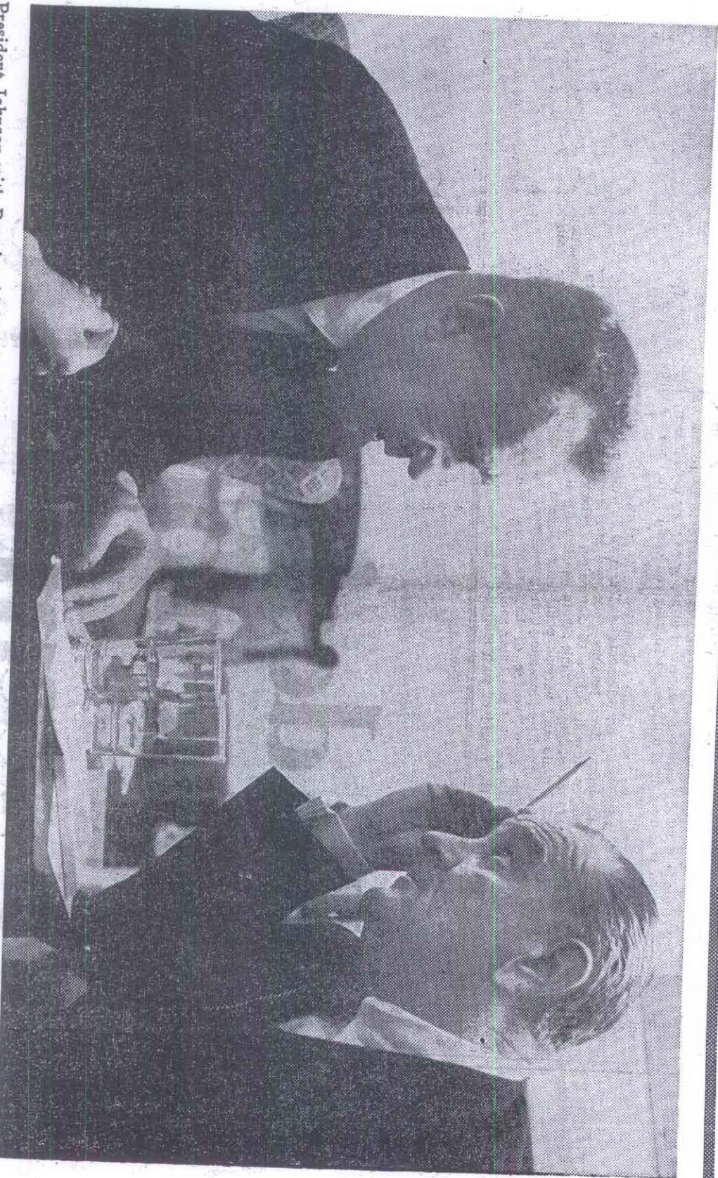
President Johnson with Premier Aleksei N. Kosygin in June, 1967, at Glassboro, N. J., a compromise between Washington and New York