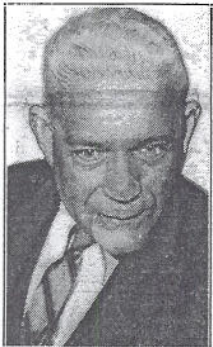
Clay Shaw Called a New Orleans plotter

ever since his announcement that he had uncovered a plot to assassinate the President.