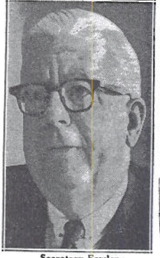
Secretary Fowler Presents tax proposals

Although some leading economic indicators have been slipping, Fowler maintained that the Administration wanted Congress to act now because the very special-