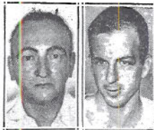
The late David Ferrie The late Lee Oswald Placed at the meeting