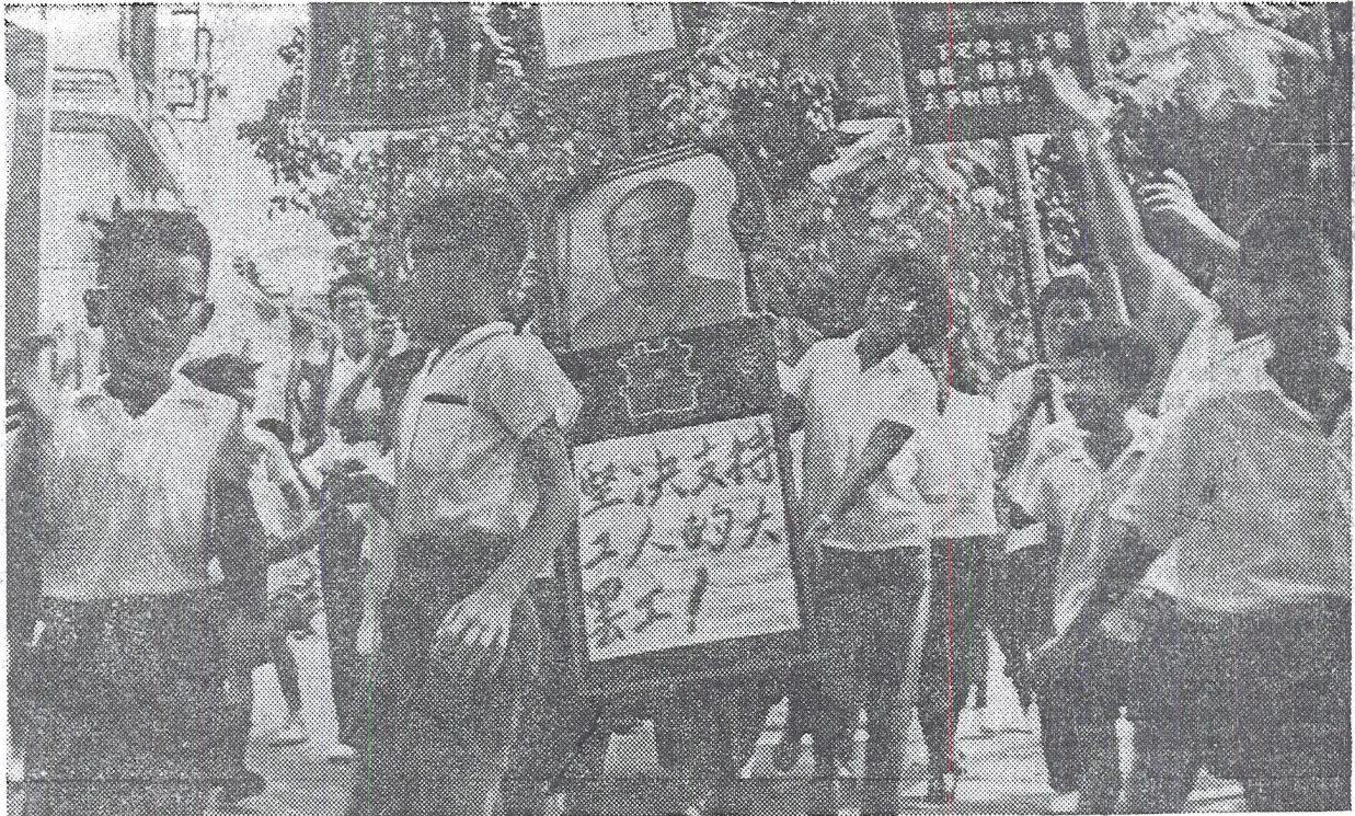
Chinese children in Hong Kong demonstrating in 1967. Overseas Chinese can be an intelligence asset for Peking.