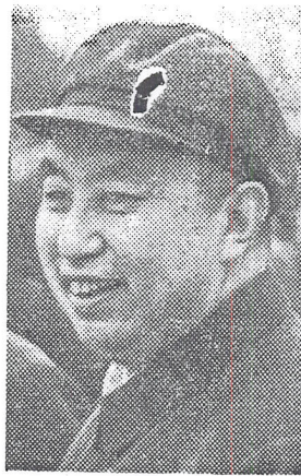
HUA KUO-FENG ...probable No. 1

In Europe, the center of Chinese secret service activity is thought to be Paris. But unlike the KGB, the Chinese secret service does not concentrate on the West. The Chinese favor a strong NATO and an economically and politically integrated Europe to counter Soviet power. Their agents try not to